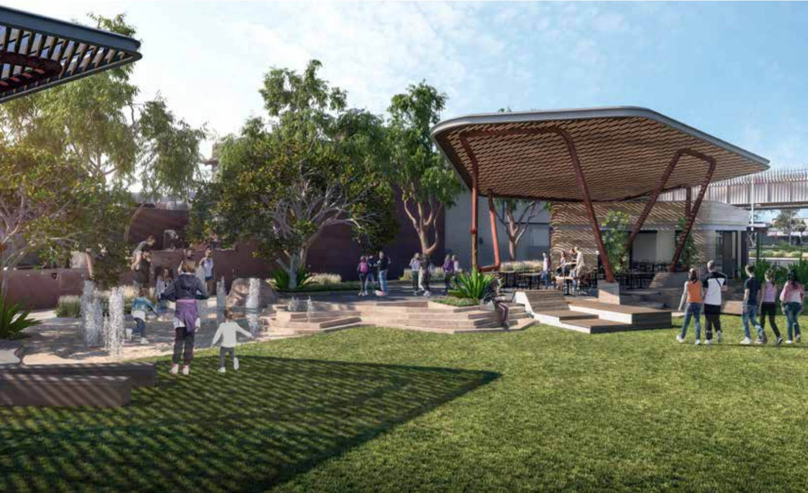
Artist impression: Beach promenade with water-play area and café/kiosk