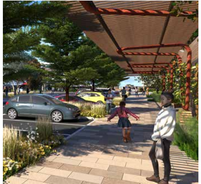
Artist impression: McLeod Road extension and beach promenade

Our design team has worked hard to update the designs for the beach promenade and village square based on this feedback to create a Carrum you will love to get out and enjoy throughout the year. Let us know what you think about the updated designs.