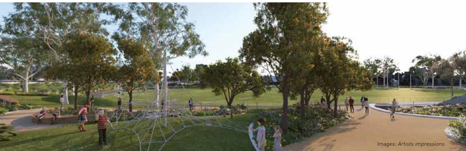
Images: Artists impressions

* Please note that the timeline above is subject to change.