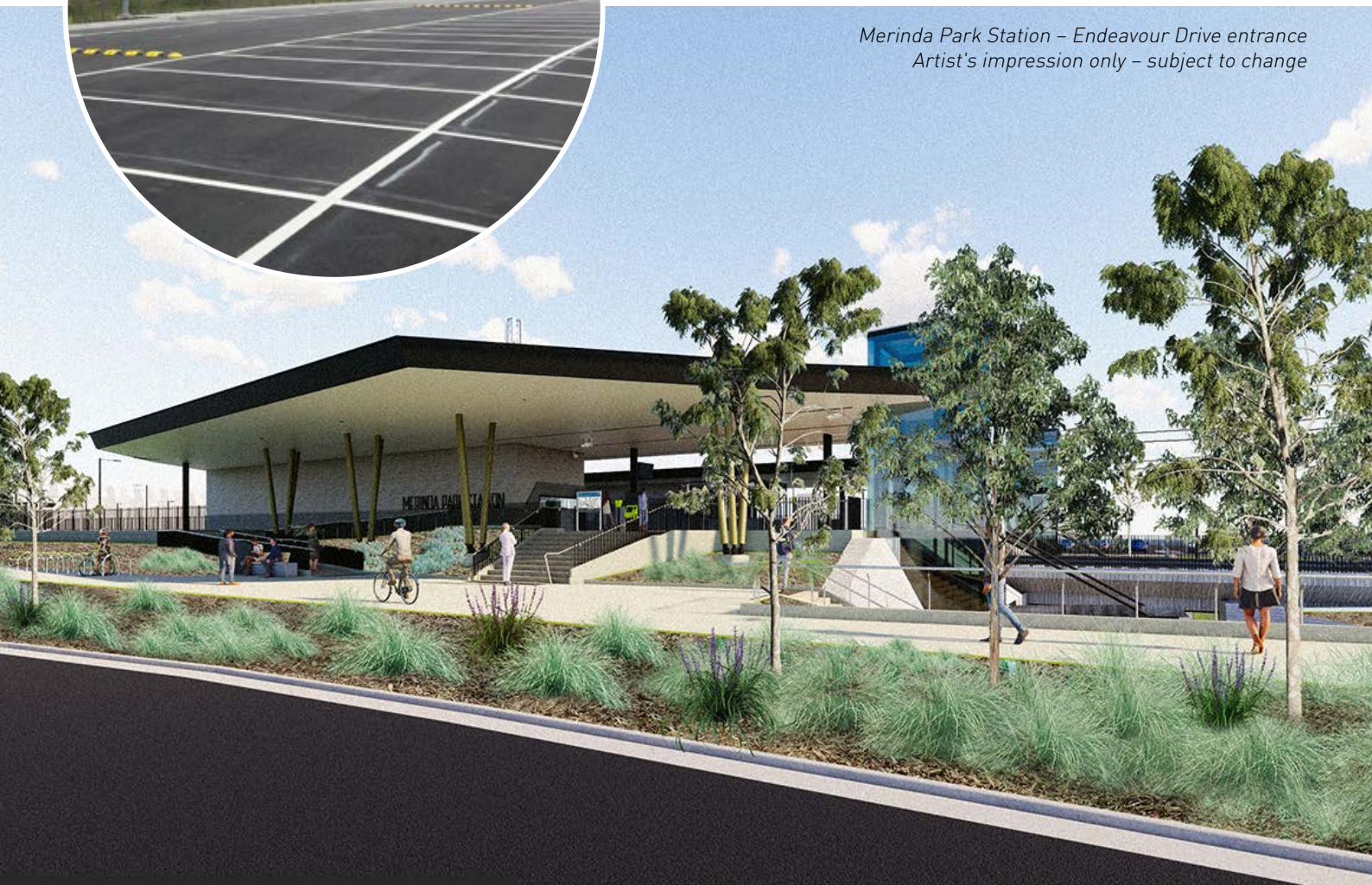
Merinda Park Station – Endeavour Drive entrance Artist's impression only – subject to change