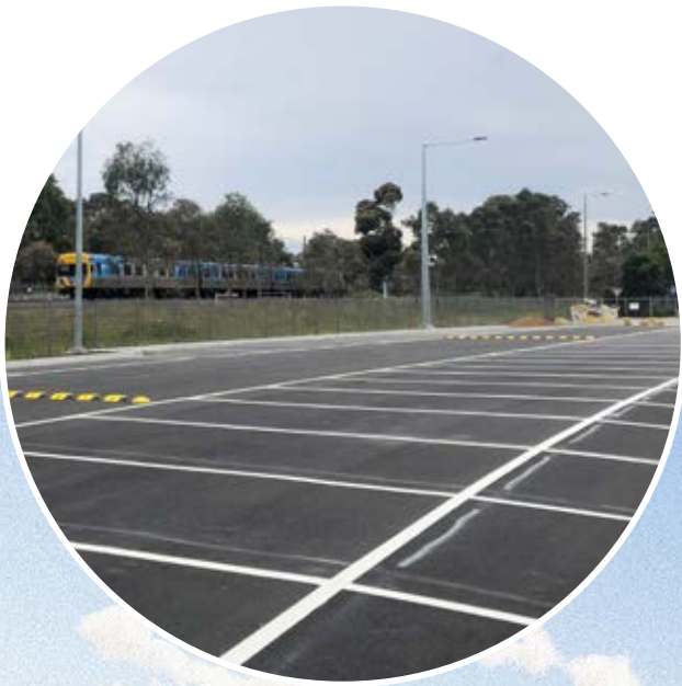
Lynbrook Station car park