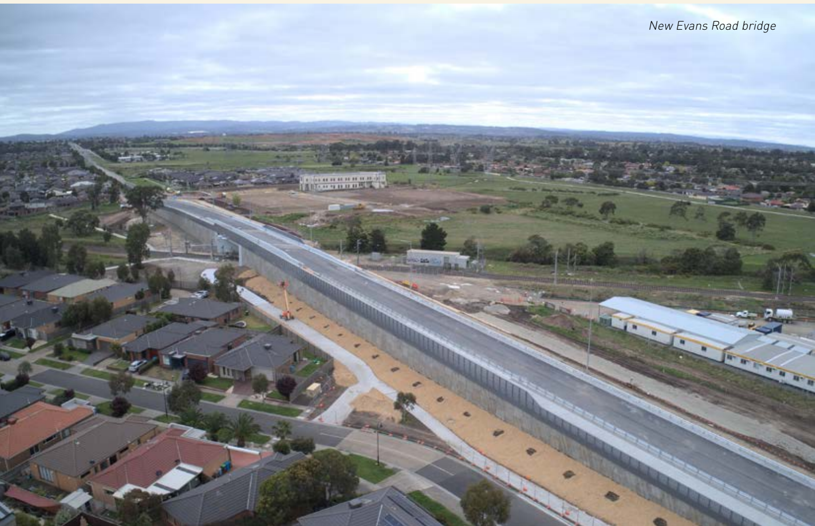
New Evans Road bridge

Works will begin towards the end of the year. It will initially be used as a safe haulage route for the Cranbourne Line Upgrade project before it is converted into a shared use path and opened to the community by 2023.