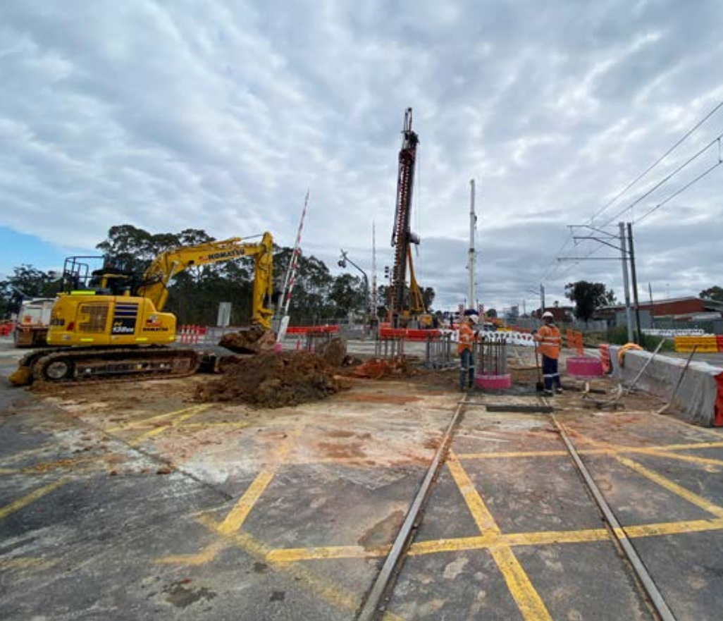
Construction underway at Greens Road